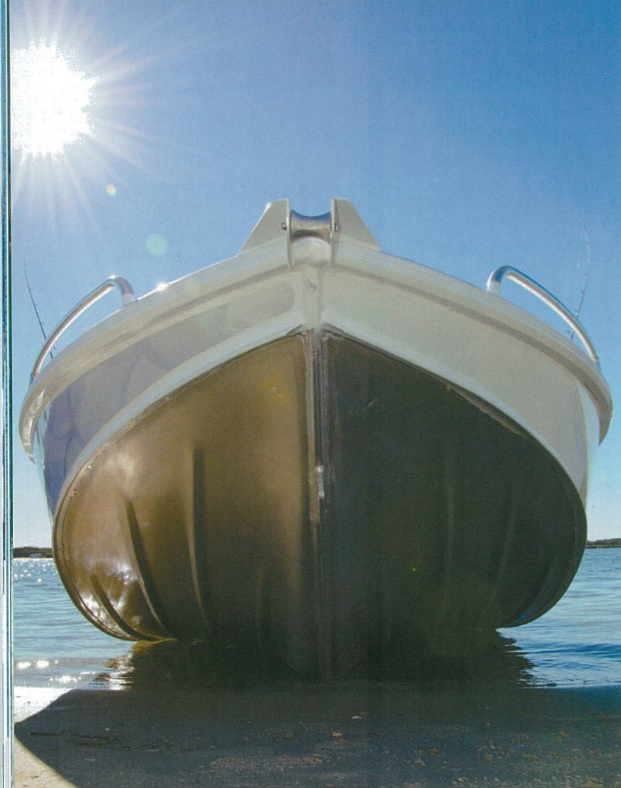
Clockwise from left: Quintrex's new Blade hull does a top job, but it's still a small tinnie and so it's really at its best in relatively flat and calm conditions; a quality wrap really brings a humble tinnie's looks to life; the 40hp Vortex two-stroke gives it plenty of punch and minimises costs; the front cast deck is spacious and hides impressive storage; various positions are available for the pedestal seating.